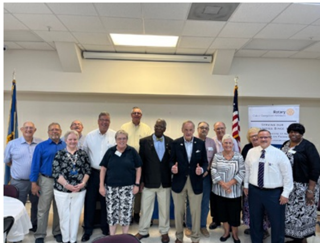
District 7630 Attends the 37th Annual Strike-Out Hunger Dinner